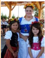
Pictured left three girls in traditional German Dress at Cullman Oktoberfest.